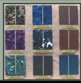
Unique Colour Cells and Backsheet Options Available